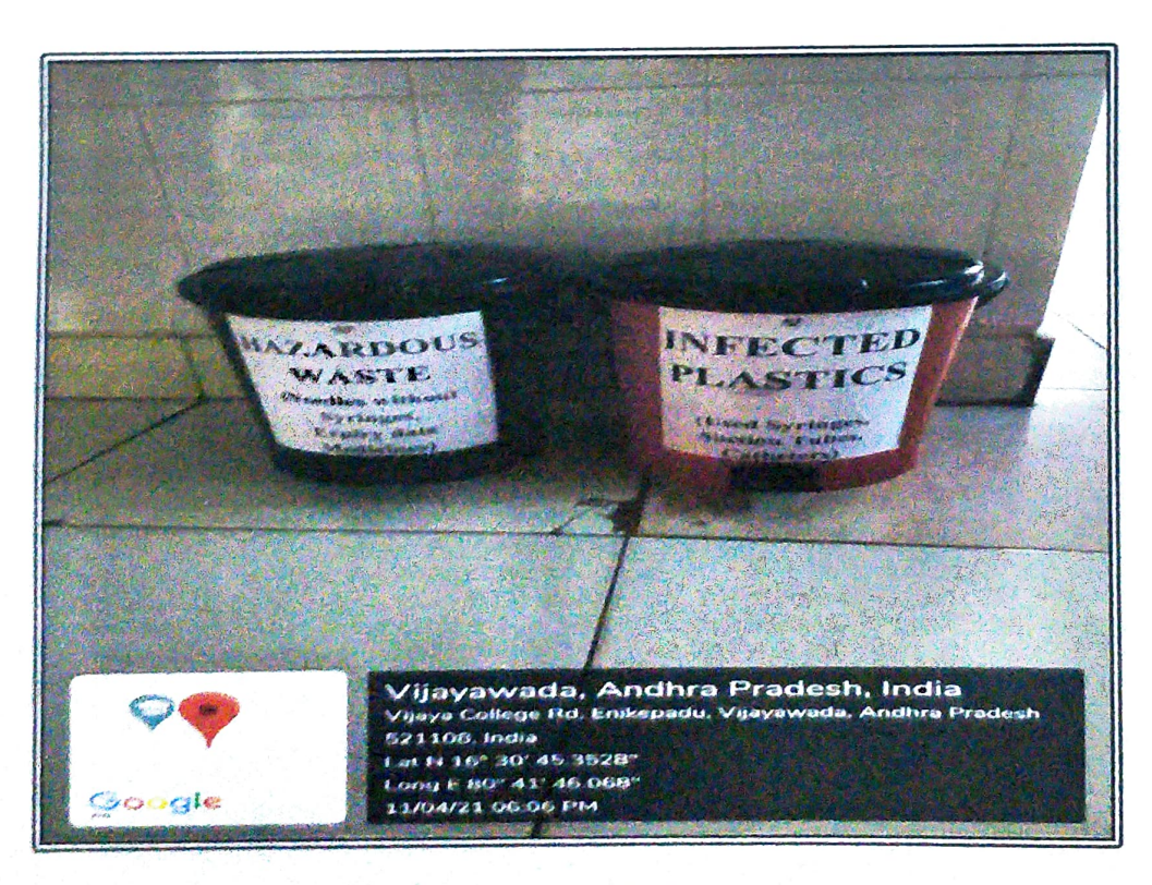
Bio-Waste bins in Laboratories