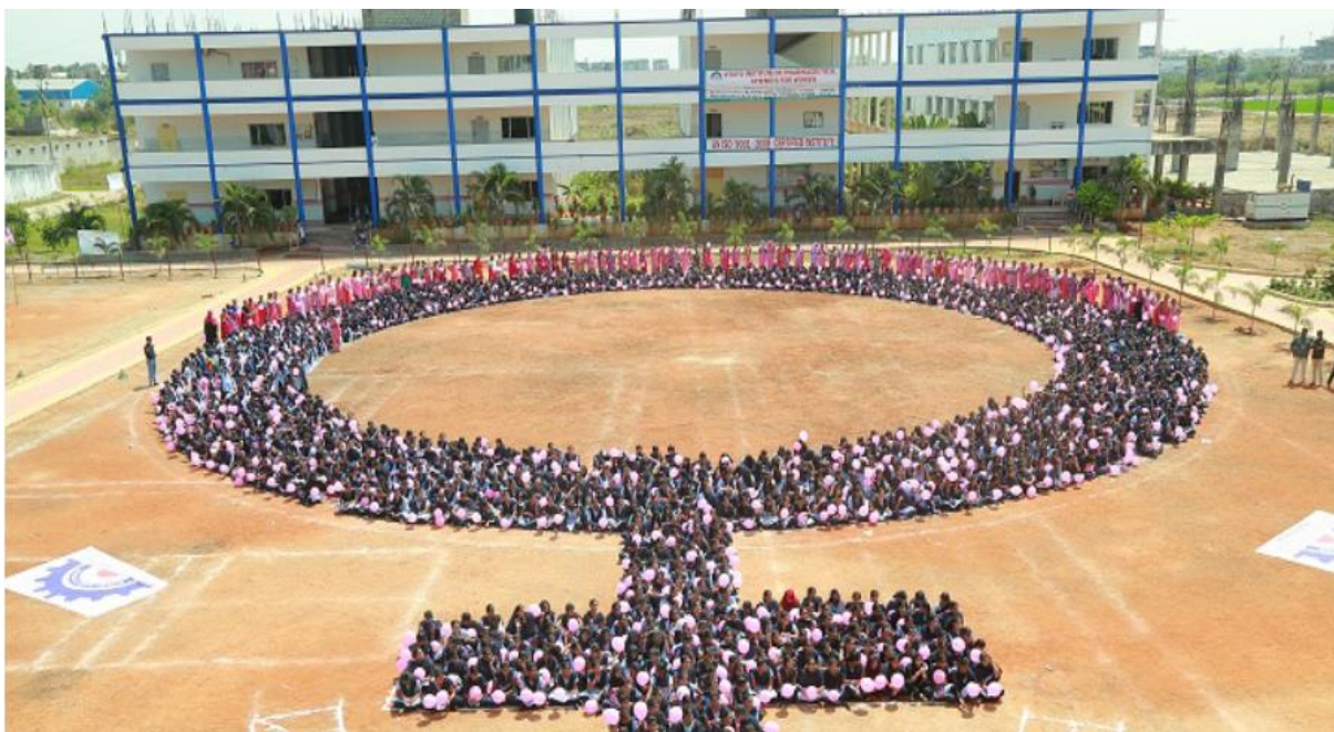
VIJAYA INSTITUTE OF PHARMACEUTICAL SCIENCES FOR WOMEN VIJAYAWADA, ANDHRA PRADESH, INDIA